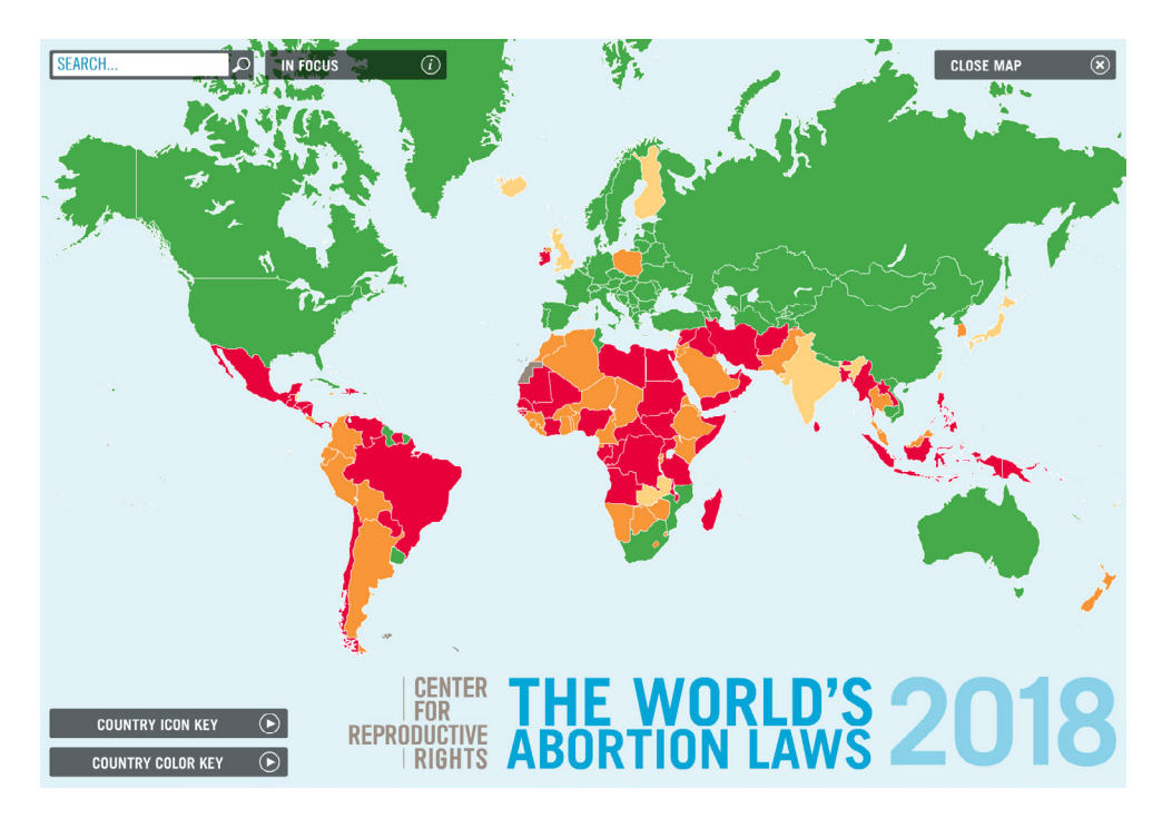
Figure 3: Abortion laws worldwide, 2018.

It is clear that improving both access to health care and the quality of health care across the globe could bring real improvements to women's health. However, looking at the underlying issues surrounding maternal mortality and morbidity and women's access to family planning and abortion services, it is also clear that in order to effect change more quickly, and ensure any change is sustainable, cultural and economic factors also need to be addressed. This would need to include both a top-down and a bottom-up approach — ensuring there is the political will to invest in women's health care, but also addressing the factors that have an adverse impact on the status of women and girls in society. This will require us to move upstream and focus on preventing problems occurring rather than trying to salvage situations after they have deteriorated.